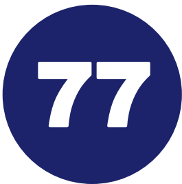
Total Student Cases (since 9/1/20)

Recovered = individuals who are no longer sick.