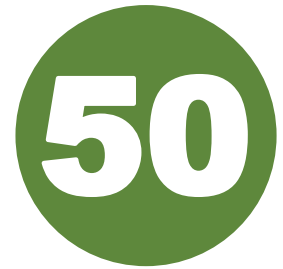
Active District Cases

Active = individuals who are confirmed positive and currently in the isolation protocol.