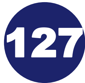
Total District Cases (since 9/1/20)

Total = total number of active & recovered cases from the start of school.