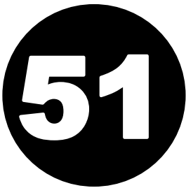
Recovered Student Cases

Active = individuals who are confirmed positive and currently in the isolation protocol.