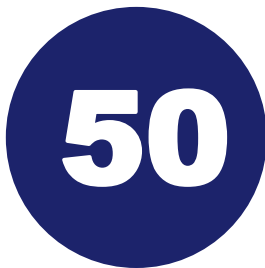
Total Staff Cases (since 9/1/20)