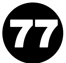
Recovered Total Cases

Recovered = individuals who are no longer sick.