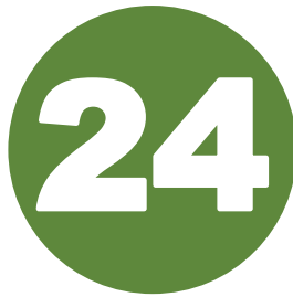
Active Staff Cases