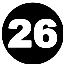
Recovered Staff Cases