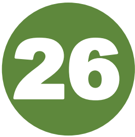
Active Student Cases